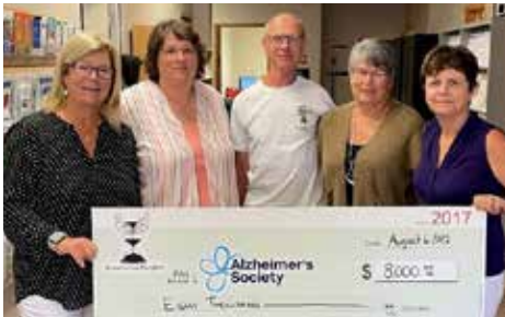
Memories in an Hourglass Golf Tournament