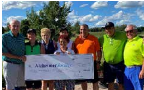
Oak Gables Golf Tournament