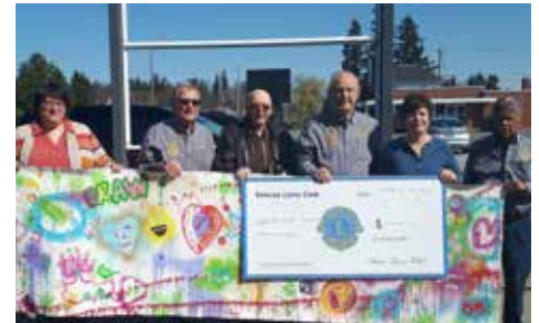
Simcoe Lions Club